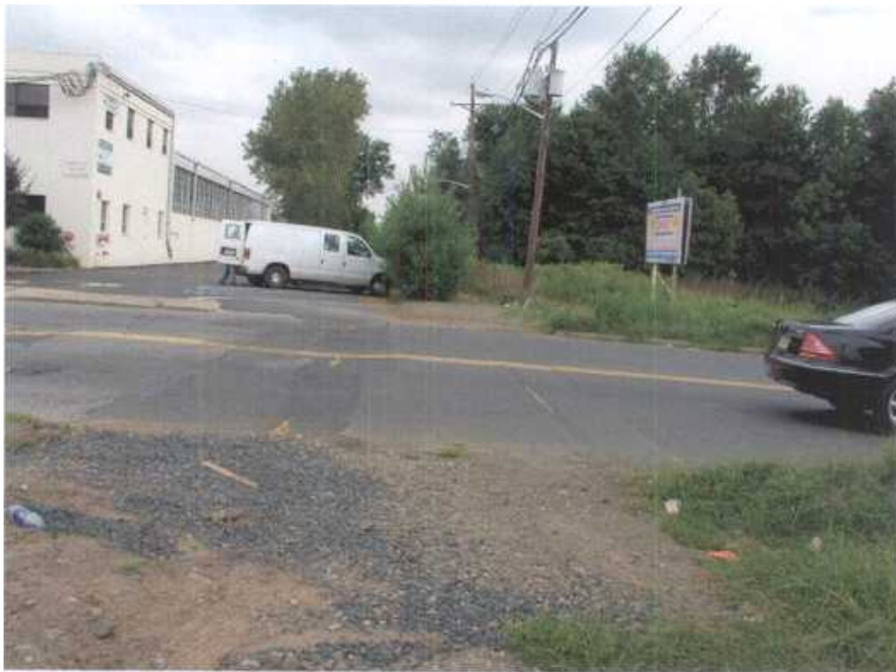
Looking directly at Liberty Ave in Union. You can see the tracks which the Dark car has just passed over. Liberty Avenue turns into Springfield Road, which leads directly into Route 22 West.