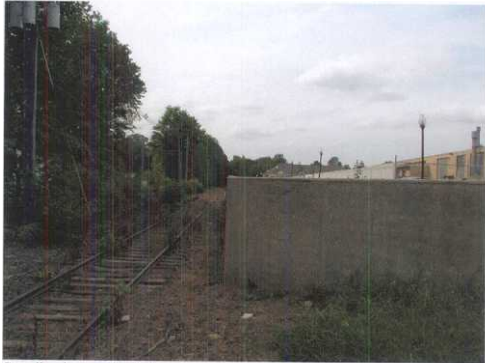
Standing just to the right of the tracks on Liberty Ave in Union. This wall shown is belongs to the Autumn Ridge Apts. There is approx 3 feet from the tracks to the wall.