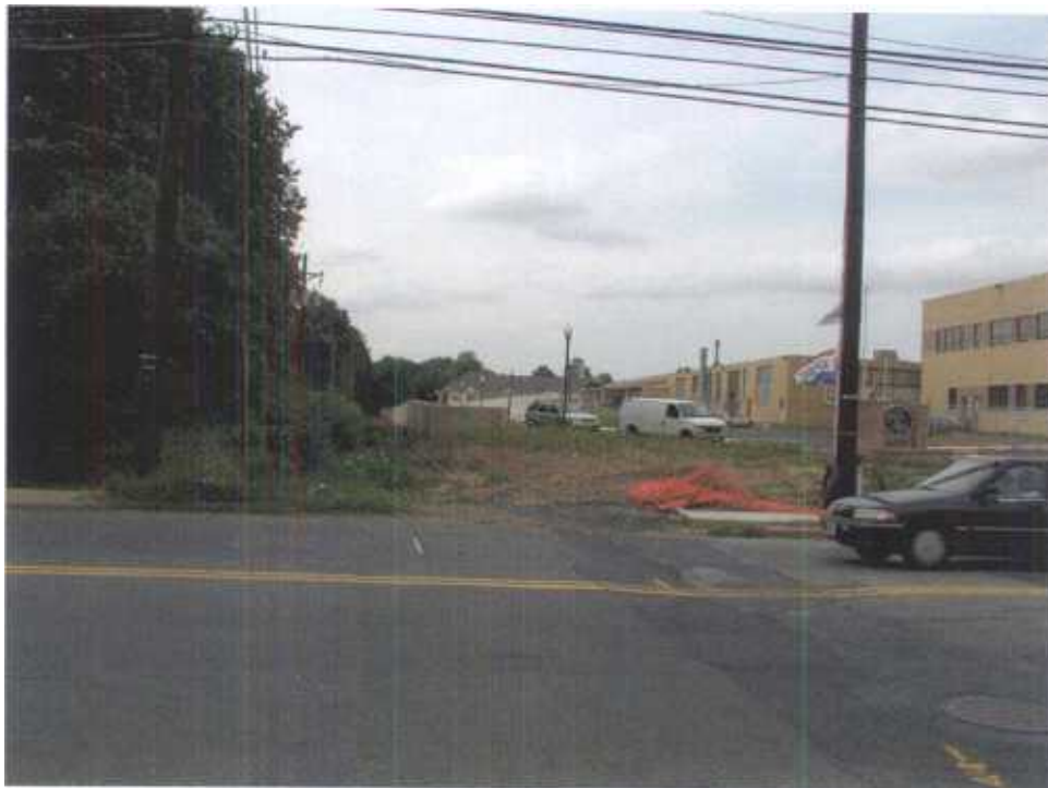
A view from the other side of Liberty Ave., facing Autumn Ridge Senior Apartments. You can see the area in the middle where the tracks have been covered over by pavement.