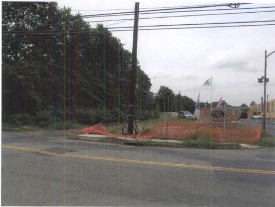
Standing on Liberty Ave in Union facing the Autumn Ridge Senior Apts. The tracks are paved over – on the left side of the picture in the dark area.