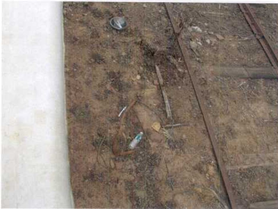
Once again, sitting on the same wall of the Senior Apts in Union, looking down at the track. You can see that the track is right next to the wall.