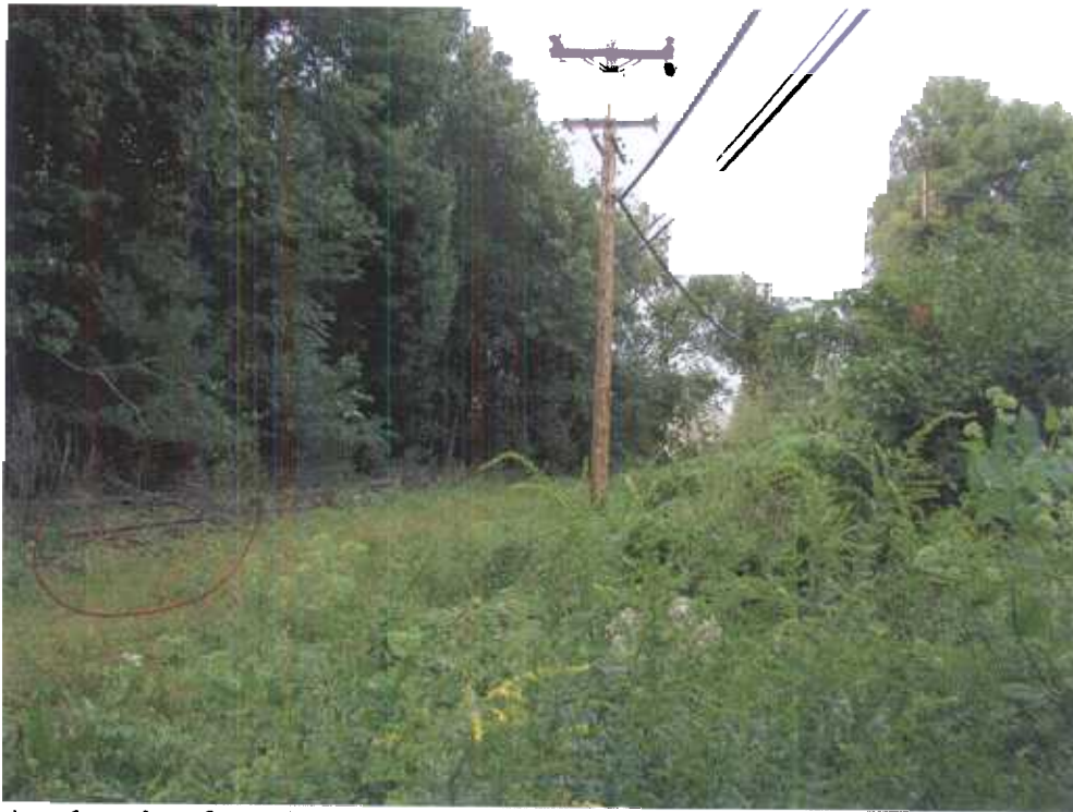
Another view from the area at Autumn Ridge Senior Apartments on Liberty Avenue in Union.