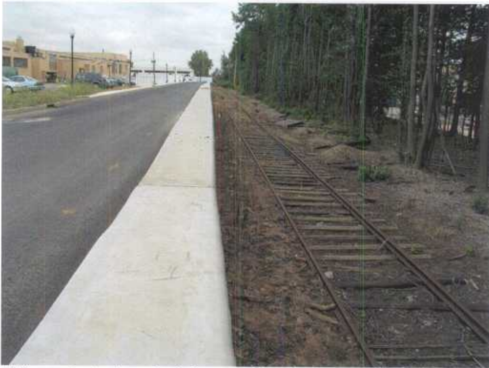
Sitting on the tracks again, facing away from the Autumn Ridge Senior Apartments, facing Liberty Ave in Union.