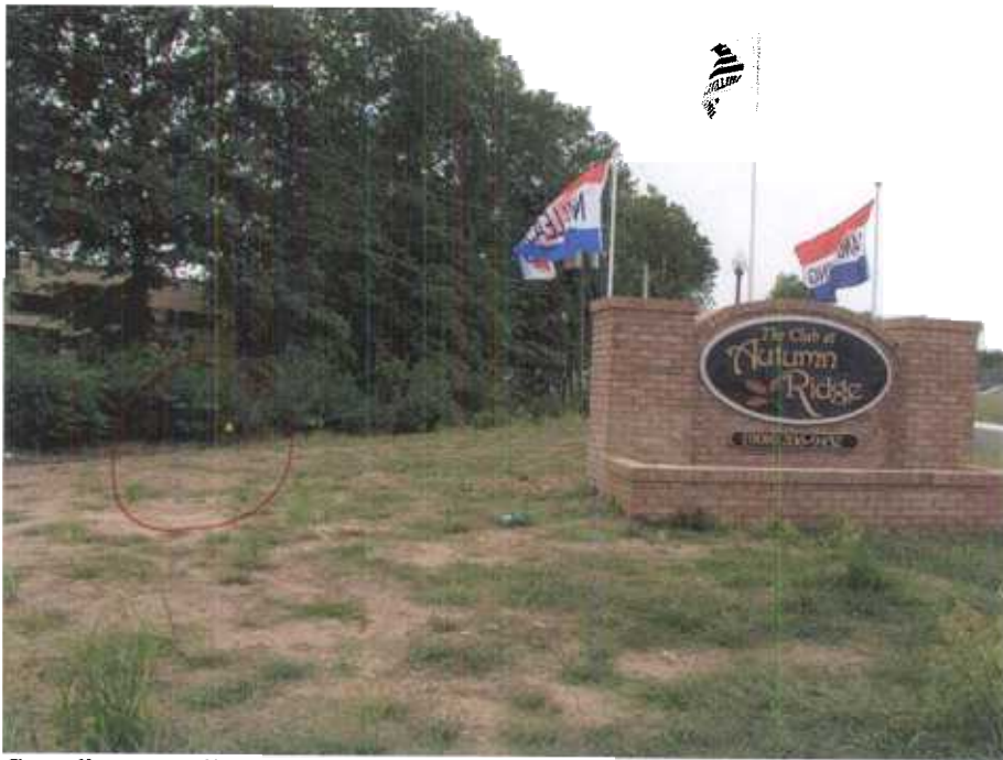
Standing on Liberty Ave in Union facing the new Autumn Ridge Senior Apartments. The train tracks are on the left side of the picture approx ½ way down the picture. You can see a white spot on the left and a yellow flag about 2 inches to the right of the tracks.