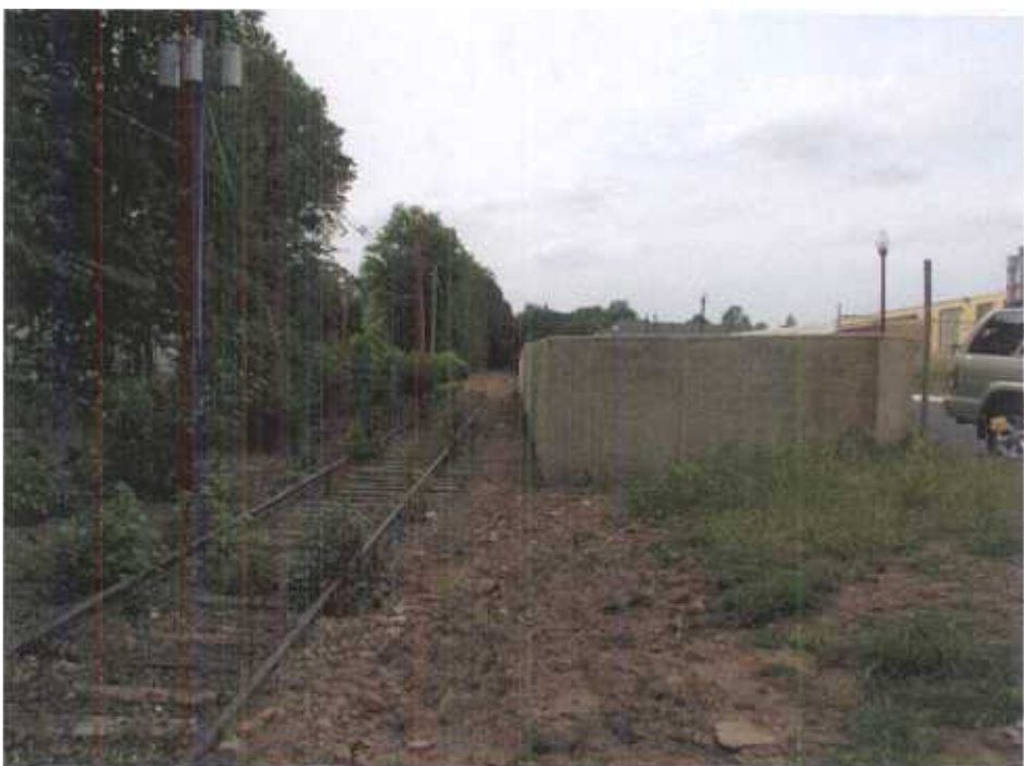
Same scenario....just a little further away. (Autumn Ridge Apts in Union)